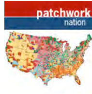
The American voter beyond red and blue