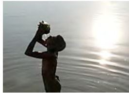
On World Water Day, a mighty global thirst