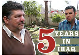
Five years in Iraq